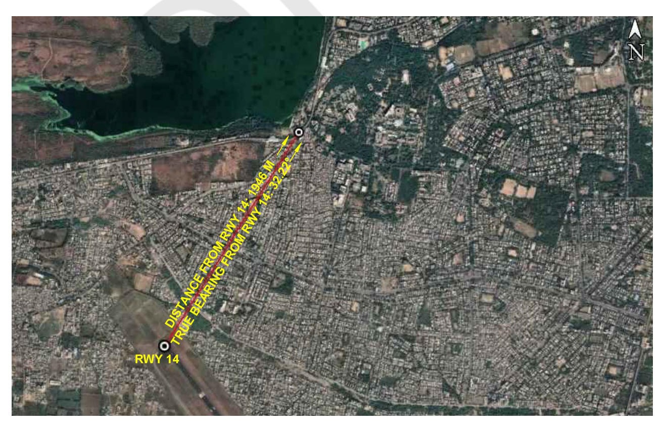
Site Elevation Certificate Issued For: Plot No. 1 & 12 ( Part 2), KH. No. 3/2, 4/2 & 5/2, Mouza - Parsodi, City Survey No. 3/4, Sheet No. 118/1 & 113/2, Ward No. 74, Tahsil & District Nagpur - 440022